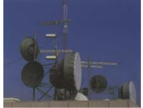
The 25B and 28B are ideal for frequency and power level testing of terrestrial microwave systems.

With a single connection, the 25B and 28B can simultaneously measure and display the input signals frequency and power level in the microwave band, eliminating the need for a separate microwave power meter. Within the 25MHz bandwidth of the YIG-preselector, only the selected signals frequency and power level are measured. Signals to be analyzed are selected by keystroke entry of an individual center frequency, or search a range between a low and high frequency limit. This signal selectivity, combined with 20MHz of FM tolerance at all rates up to 10MHz, allows the 25B and the 28B to make accurate frequency and power level measurements even while the input signal is carrying traffic; there is no need to take the transmitter, or adjacent channels, off the air for routine checks.