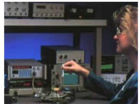
These useful counters are as capable on the bench as in the field. Their high performance matches or exceeds the best performance available in larger, bench-top instruments.